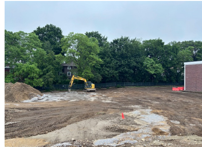
Ground Improvements in area of new building