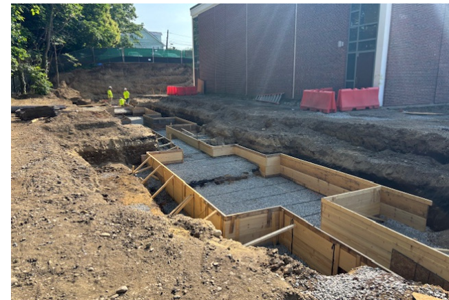
Formwork in place