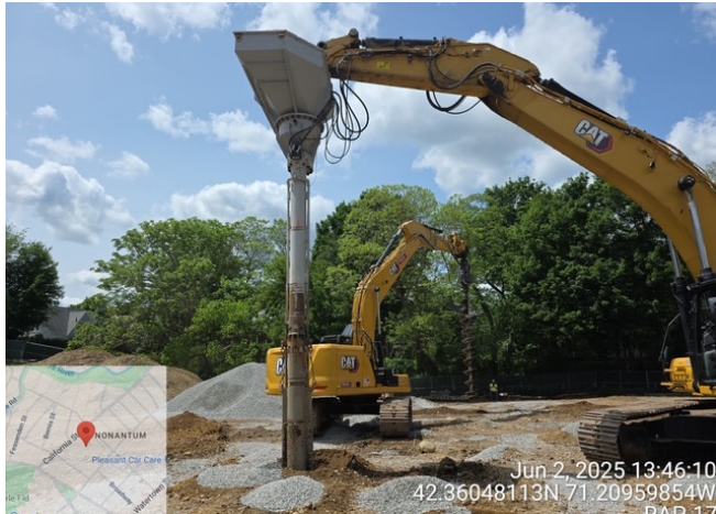
Close-up of ground improvements under way