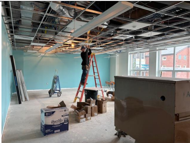
Installing FA Devices on the 1st Floor of the South Addition