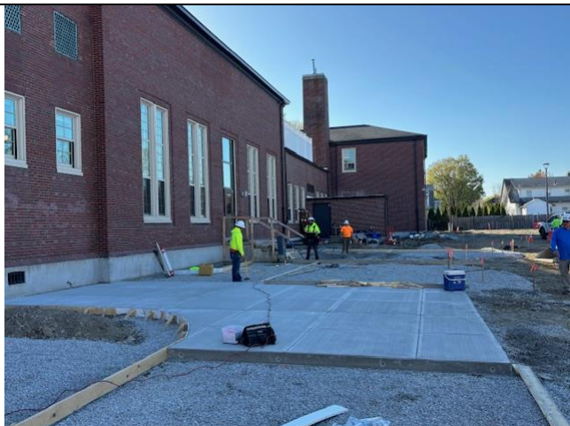
Plaza South of the Existing Building