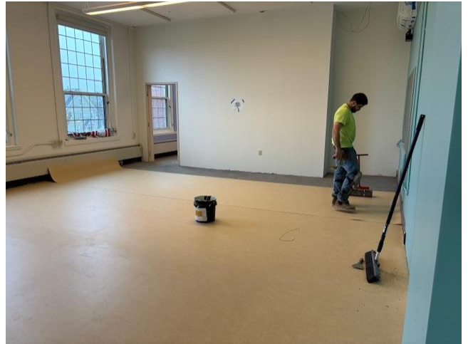
Completing Sheet Resilient Flooring at the 2nd Floor of the Existing Building