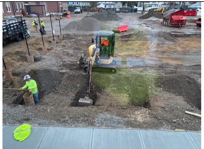
Prep for Basketball Court Fence Posts