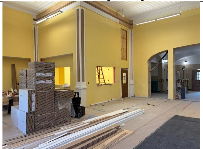
Installing Millwork in the Library