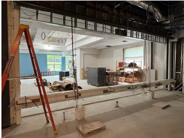
Commenced Installing Roll-Up Door at the Kitchen